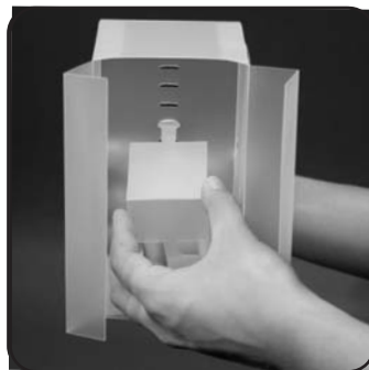
Lock in the Stopper to Prevent Spools from Falling Over

Each drawer interlocks with one another by placing the feet located on the bottom of each drawer into the corresponding slots located on the top of each drawer.