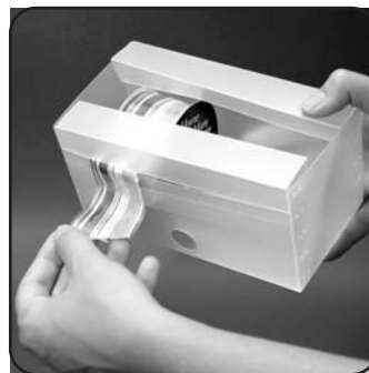
Thread Ribbon End Under Dispensing Strip for Easy Access

Fold and score stopper in half. Take one end of tab and lock into needed slot. Place and lock other tab into the closest slot for strength and support.