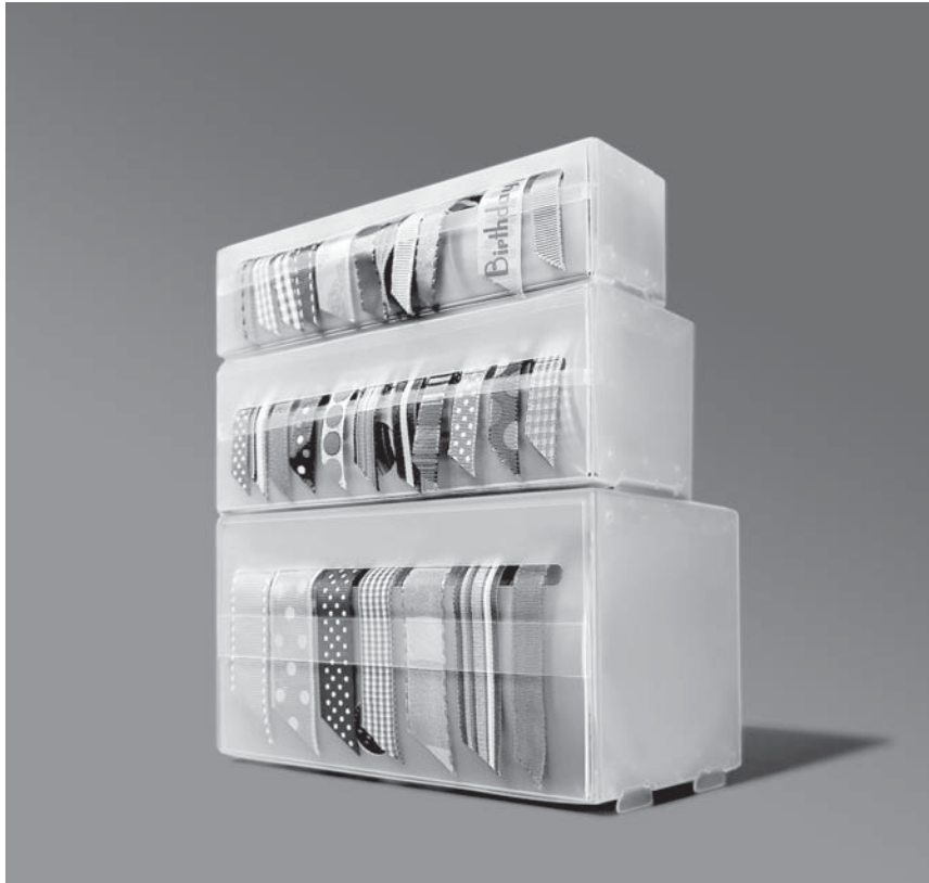
Ribbon Pictured Not Included