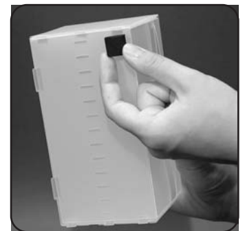
Rubber Feet Included to Prevent Sliding

Thread each ribbon end gently under the dispensing strip to keep ribbon in place and for easy dispensing.